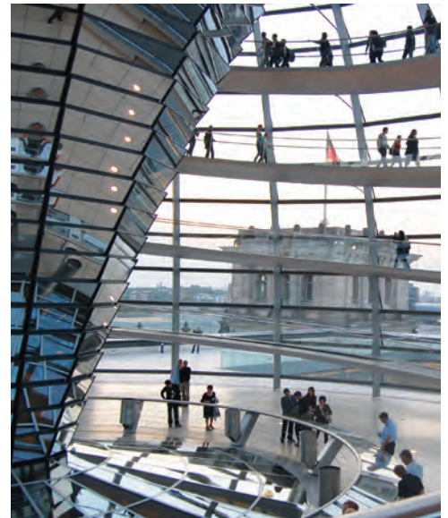
Reichstag dome interior (Josiah Mackenzi)

The evening is at leisure and we will provide a list of recommended nearby restaurants.