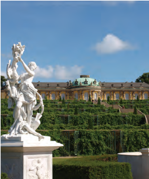
Sanssouci Palace (Nigel Swales)