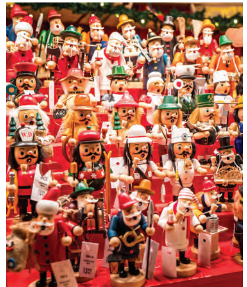
Christmas Market characters, Berlin