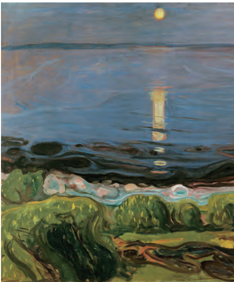
Edvard Munch's Summer Night by the Beach (1902-03)

This evening, we will be welcomed into the Museum Barberini for a private reception with appetizers, wine, and traditional German Christmas cookies. Next, we will have an after-hours tour of Edvard Munch: Transforming Nature , the first exhibition of landscapes by the Norwegian painter, which brings together over ninety loans from institutions around the world.