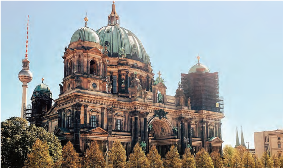
Berlin Cathedral (Karli Cumber)