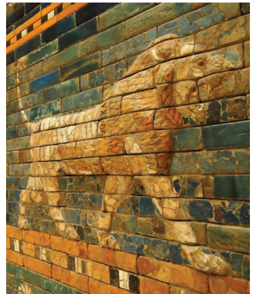
Ishtar Gate, detail, in the Pergamon Museum (momo)