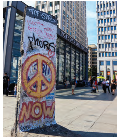
A piece of the Berlin Wall in Potsdamer Platz

This evening, we'll bid auf wiedersehen to Berlin at our farewell dinner in the intimate private drawing room of Borchardt, one Berlin's top restaurants.