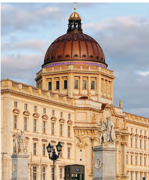
Humboldt Forum

This afternoon, we'll drive along Potsdamer Platz to see how this area has been completely transformed since German reunification from a "no man's land" into an exciting new architectural and cultural mecca, bridging Berliners from both sides of the former divide. It now boasts some of the city's most impressive contemporary architecture and has become a symbol of the new Berlin.