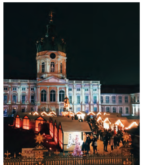
Christmas Market at Charlottenburg Palace